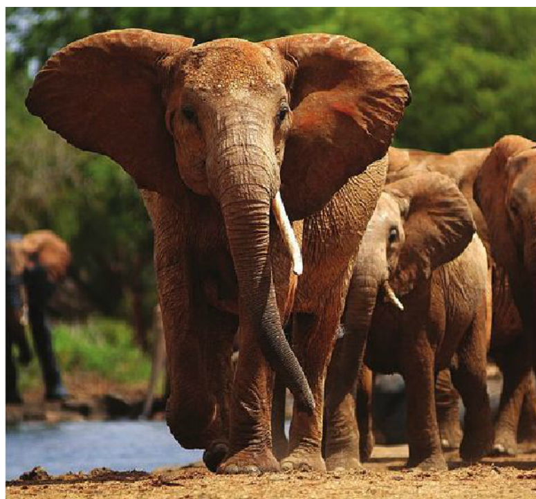
FAR RIGHT: Laikipia